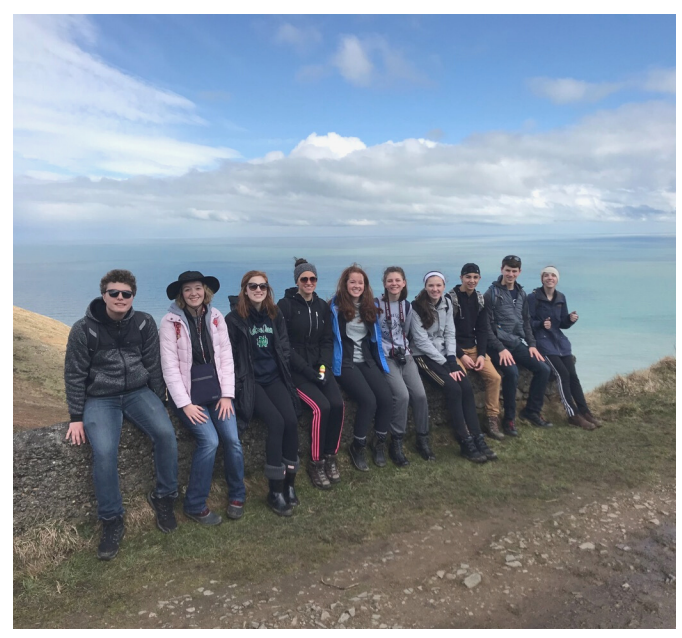
Class of 2018 Senior Trip - Ireland, Cliffs of Moher.