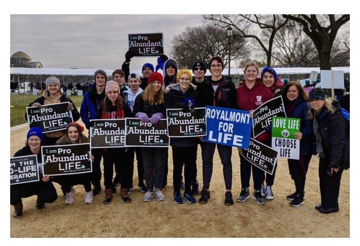
Royalmont High School students attended the 2020 March for Life.