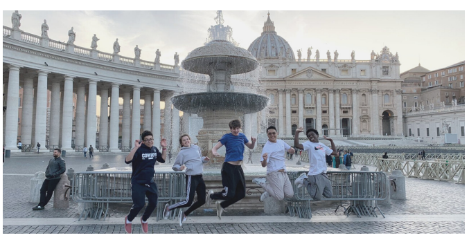
Class of 2019 Senior Trip - Rome, Italy.

Our next class of seniors are very excited to start their own pilgrimage preparation!