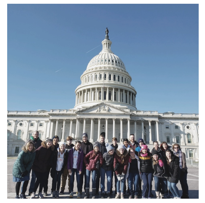
8th grade students and chaperones visited our nation's capital and attended the March for Life during the annual 8th grade class trip in January of 2020.