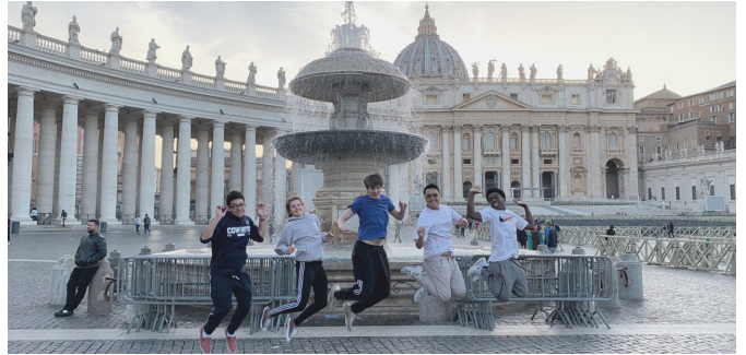
Class of 2019 Senior Trip - Rome, Italy.

Our next class of seniors are very excited to start their own pilgrimage preparation!