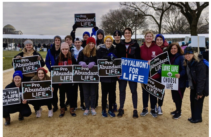
Royalmont High School students attended the 2020 March for Life.