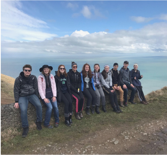
Class of 2018 Senior Trip - Ireland, Cliffs of Moher.