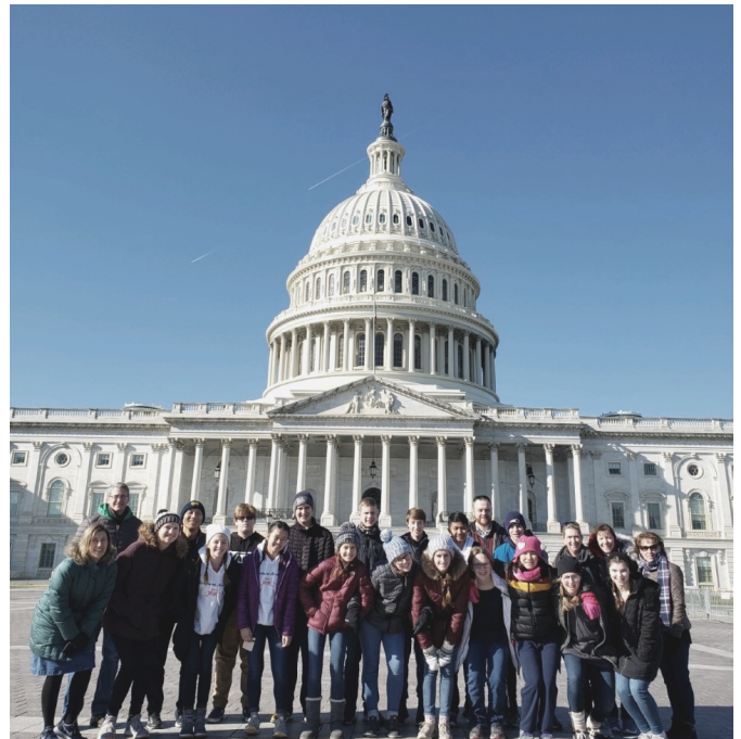
8th grade students and chaperones visited our nation's capital and attended the March for Life during the annual 8th grade class trip in January of 2020.